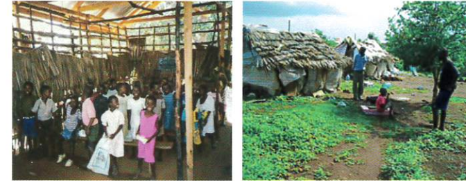
Mikoroshoni Primary School in 1996